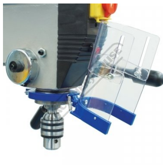
Safety Chuck Guard Flipped Up