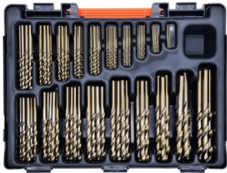
D126 Metric 135° Precision HSS Drill Set - 170 Pieces