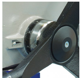
Drilling Depth Stop Setting With Scale