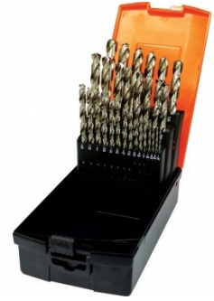
D1282 Imperial 135° Precision HSS Drill Set - 29 Piece