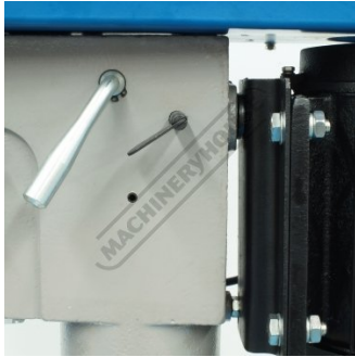
Belt Tension Lever and Lock