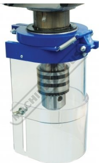
Adjustable Safety Chuck Guard with Flip Up Screen