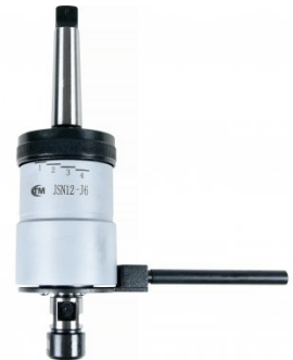
T004 Reversible Tapping Chuck - Adjustable Clutch