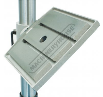
Tilting and Rotating Cast Iron Table