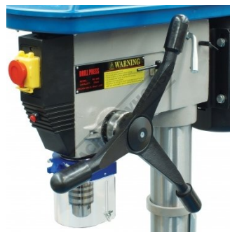
1 Piece Cast Iron Drilling Lever