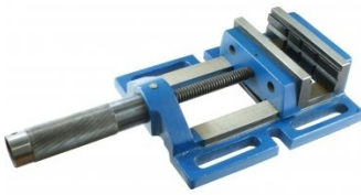
V145 Drill Press Vice