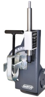
P090 Pipe & Tube Notcher Attachment