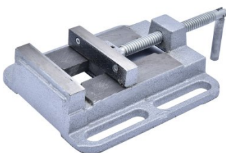
V124 Drill Press Vice