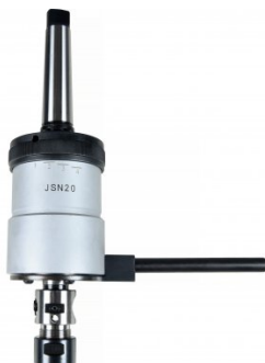
T005 Reversible Tapping Chuck - Adjustable Clutch