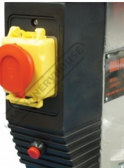
Emergency Stop Switch and Light Switch