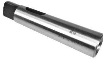
D422 Drill Sleeve - Morse Taper