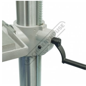
Table Height Adjustment Crank