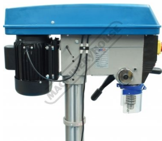
Head Side View