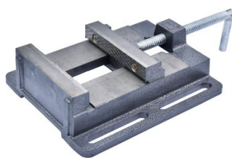
V125 Drill Press Vice