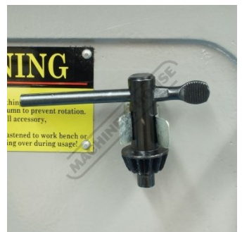
Chuck Key Holder