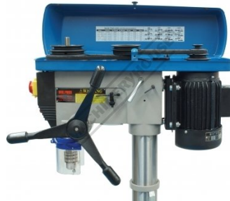
A Section Belt Drive System