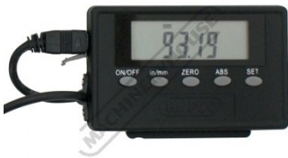
Digital Display Unit