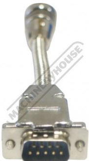
DSub9 Male Plug