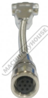
DIN7 Female Plug