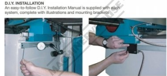
DIY INSTALLATION An easy-to-follow DIY Installation Manual is supplied with each system, complete with illustrations and mounting brackets.