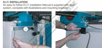
DIY INSTALLATION An easy-to-follow DIY Installation Manual is supplied with each system, complete with illustrations and mounting brackets.