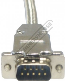
DSub9 Male Plug