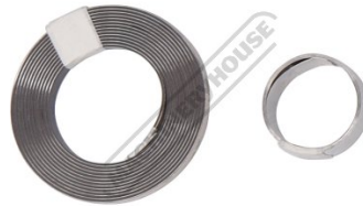
Magnetic Tape and Metal Protective Strip