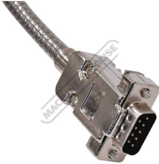
Dsub 9 Male Plug