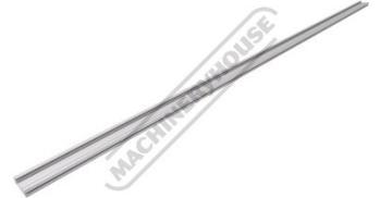
Aluminium Extrusion Length