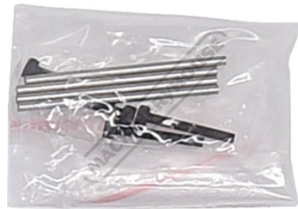
Aluminium Extrusion Joiner Pins