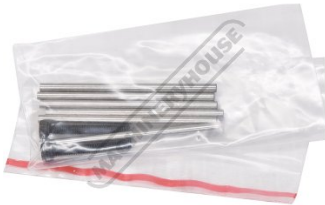
Aluminium Extrusion Joiner Pins