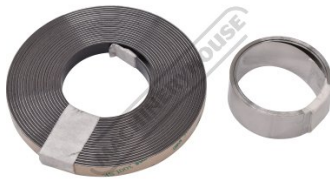
Magnetic Tape and Metal Protective Strip