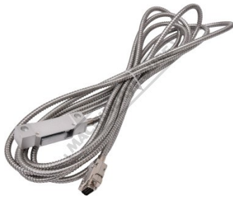
Dsub 9 and Reader Head Extension Cable