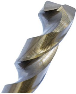
135° Split Point - M35 Grade HSS 5% Cobalt