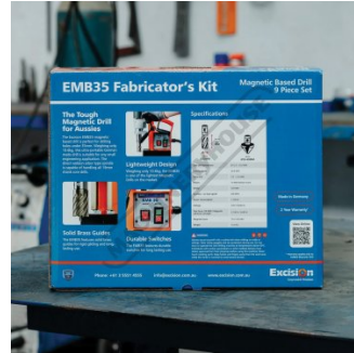
Box Rear Side