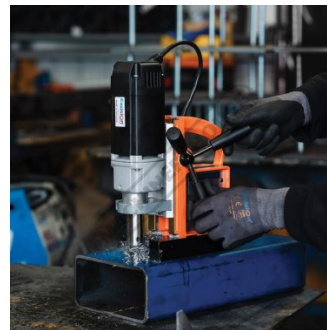
Action Drilling 3