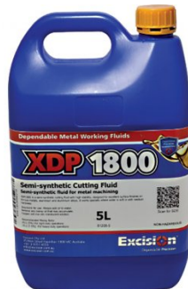
S090 Soluble Metal Cutting Fluid - 5 Litre