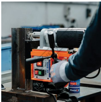
Action Drilling 2