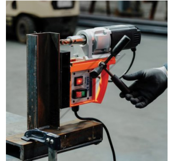
Action Drilling 1