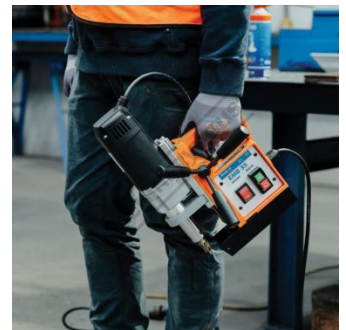
Action Carry Handle