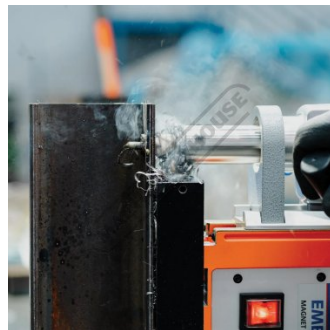
Action Drilling 5