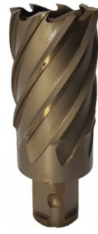
D932A HSS-Co (5% Cobalt) Drill Broach Cutter