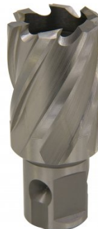
D9526 HSS Drill Broach Cutter