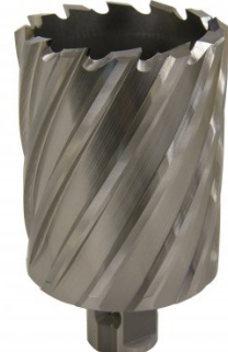
D9584 HSS Drill Broach Cutter