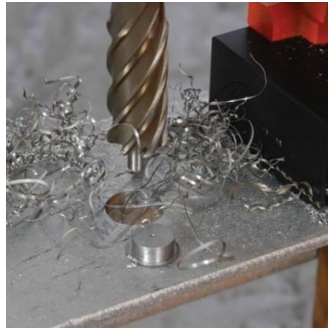
Shown in Action