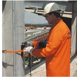
Shown in Action on Job Site