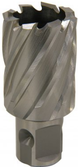
D9528 HSS Drill Broach Cutter