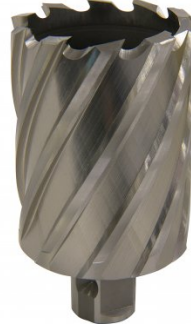
D9582 HSS Drill Broach Cutter