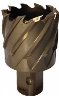
D936 HSS-Co (5% Cobalt) Drill Broach Cutter