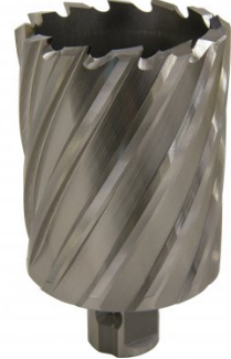
D9584 HSS Drill Broach Cutter