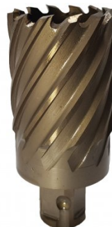
D938A HSS-Co (5% Cobalt) Drill Broach Cutter