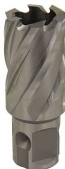
D9524 HSS Drill Broach Cutter