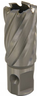
D9522 HSS Drill Broach Cutter