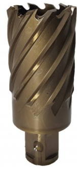
D935A HSS-Co (5% Cobalt) Drill Broach Cutter