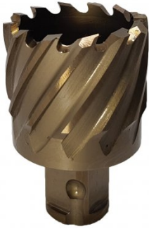
D940 HSS-Co (5% Cobalt) Drill Broach Cutter