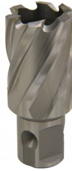
D9526 HSS Drill Broach Cutter