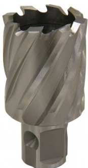
D9532 HSS Drill Broach Cutter