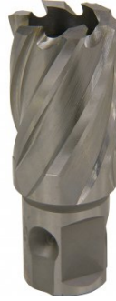
D9523 HSS Drill Broach Cutter