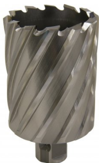
D9584 HSS Drill Broach Cutter