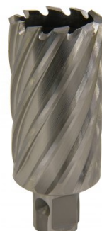
D9574 HSS Drill Broach Cutter