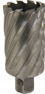
D9576 HSS Drill Broach Cutter