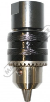
Includes Drill Chuck