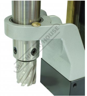
Shown with Optional Broach Cutter