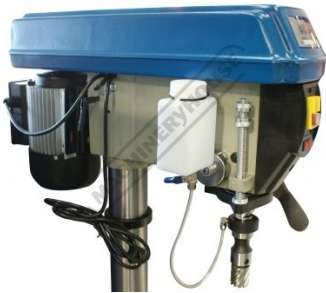
Shown Mounted to Drilling Machine