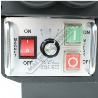
Semi Auto Feed Switching