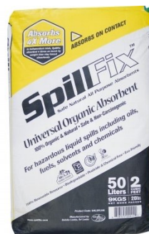
O000 SpillFix Universal Organic Absorbent