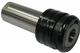
D9504 Quick Release Chuck - Broach Cutter Adaptor