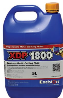
S090 Soluble Metal Cutting Fluid - 5 Litre