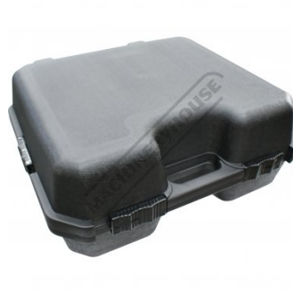
Durable Plastic Case