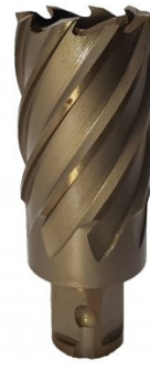
D932A HSS-Co (5% Cobalt) Drill Broach Cutter