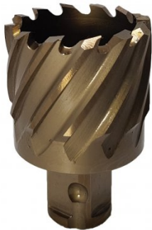
D940 HSS-Co (5% Cobalt) Drill Broach Cutter