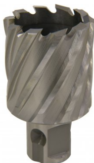
D9535 HSS Drill Broach Cutter