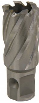
D9523 HSS Drill Broach Cutter