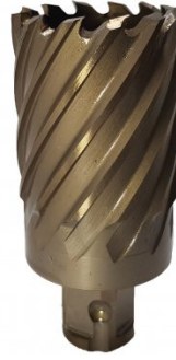
D938A HSS-Co (5% Cobalt) Drill Broach Cutter