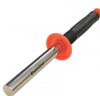
L300 Magnetic Swarf Remover