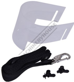
Included Safety Guard Strap