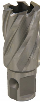
D9524 HSS Drill Broach Cutter