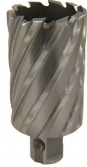
D9578 HSS Drill Broach Cutter