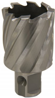
D9534 HSS Drill Broach Cutter