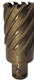
D934A HSS-Co (5% Cobalt) Drill Broach Cutter