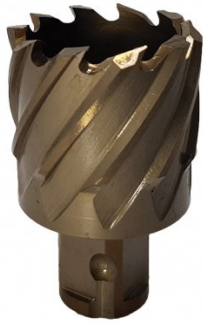
D936 HSS-Co (5% Cobalt) Drill Broach Cutter