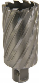
D9576 HSS Drill Broach Cutter