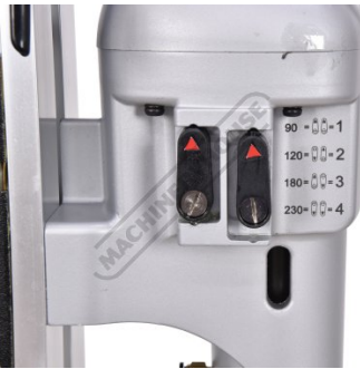
Four Speed Gearbox