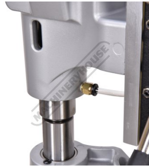
Through Spindle Coolant Feed