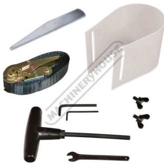
Tooling and Parts