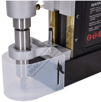
Chuck Safety Guard Cutter Not Included