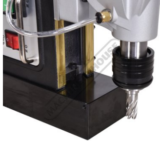
Quick Release chuck Cutter Not Included