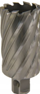
D9576 HSS Drill Broach Cutter