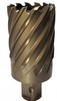
D938A HSS-Co (5% Cobalt) Drill Broach Cutter