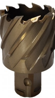
D936 HSS-Co (5% Cobalt) Drill Broach Cutter