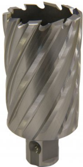
D9578 HSS Drill Broach Cutter