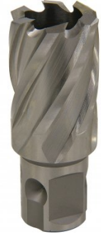
D9524 HSS Drill Broach Cutter