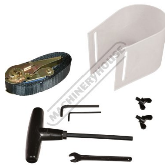
Tooling and Parts