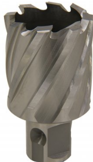
D9534 HSS Drill Broach Cutter