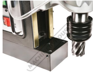
Quick Release Chuck (Cutter Not Included)