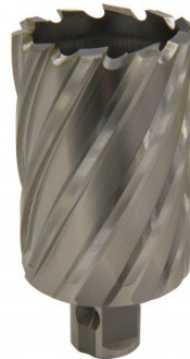
D9580 HSS Drill Broach Cutter