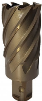
D932A HSS-Co (5% Cobalt) Drill Broach Cutter