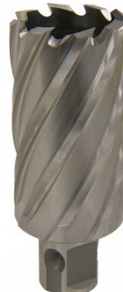
D9572 HSS Drill Broach Cutter