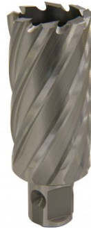
D9570 HSS Drill Broach Cutter