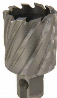
D9535 HSS Drill Broach Cutter