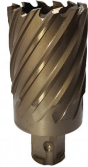
D938A HSS-Co (5% Cobalt) Drill Broach Cutter