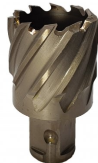
D934 HSS-Co (5% Cobalt) Drill Broach Cutter