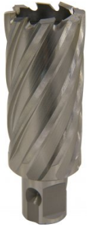
D9568 HSS Drill Broach Cutter