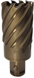
D935A HSS-Co (5% Cobalt) Drill Broach Cutter