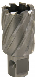
D9528 HSS Drill Broach Cutter