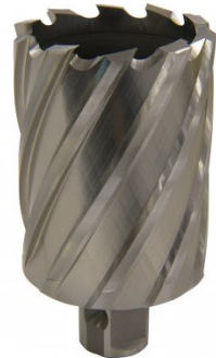
D9582 HSS Drill Broach Cutter