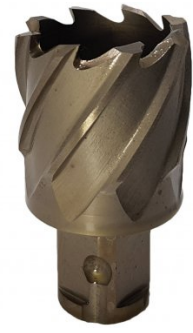
D932 HSS-Co (5% Cobalt) Drill Broach Cutter