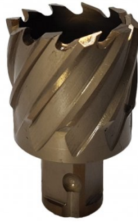
D936 HSS-Co (5% Cobalt) Drill Broach Cutter