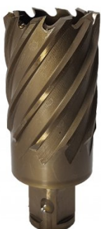
D934A HSS-Co (5% Cobalt) Drill Broach Cutter