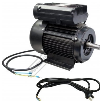
Shown with Lead