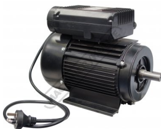
Shown with Lead