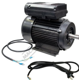
Shown with Lead