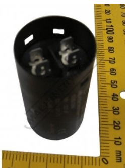
EC216 CAPACITOR 189 227uF 125V START