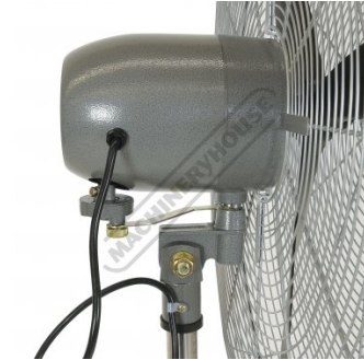
Motor Left View