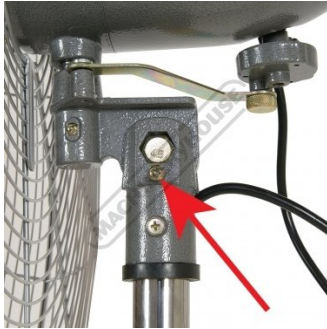
Head Tilt Locking Screw