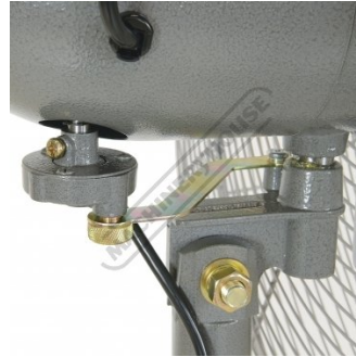
Oscillating Head Mechanism