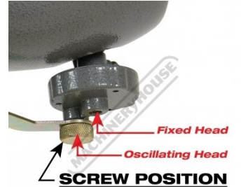
Fixed or Oscillating Screw Position