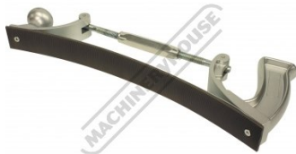
Shown with Optional File Bottom View Angle