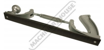
Shown with Optional File Bottom View