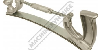
Shown with Optional File Top View Angle