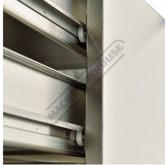
Nylon Roller Bearing Slides