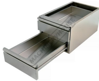
Large Draw Opening