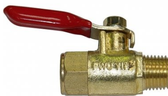
F930 Air Fittings