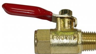
F930 Air Fittings