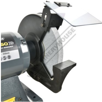
Eye Shield and Tool Rest