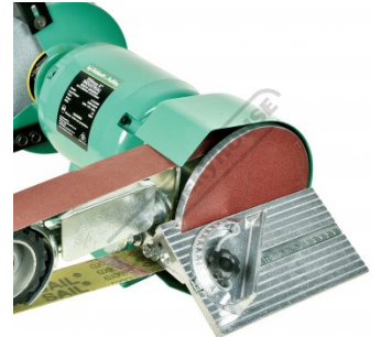
Shown on Linisher Grinder G152