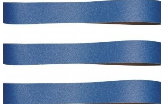
A8010 60G Zirconia Linishing Belt Pack