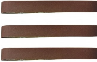
A8006 400G Aluminium Oxide Linishing Belt Pack