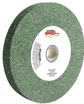
G170 Silicon Carbide Grinder Wheel