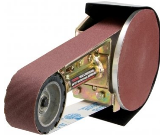
L085 Multitool Belt & Disc Linishing Attachment