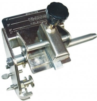
L083 Multitool Chisel Sharpening Jig