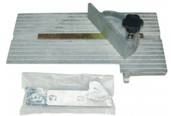
L086 Multitool Tilting Table & Mitre Guide