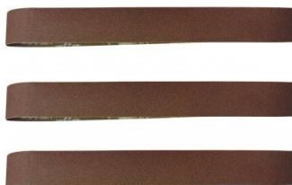
A8004 120G Aluminium Oxide Linishing Belt Pack