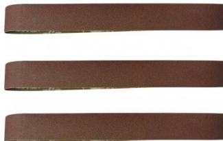
A8000 40G Aluminium Oxide Linishing Belt Pack