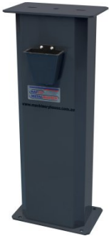
G182 Bench Grinder Stand