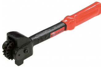
G189A Grinding Wheel Dresser - Rotary Cutter Type