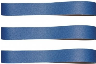
A8012 100G Zirconia Linishing Belt Pack