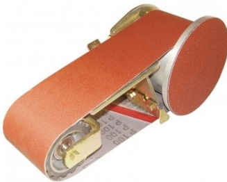
L087 Multitool Belt & Disc Linishing Attachment