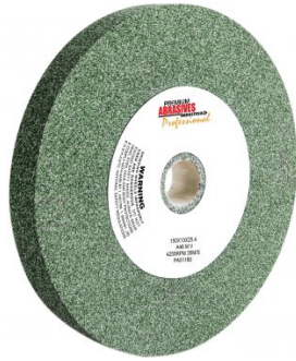
G170 Silicon Carbide Grinder Wheel