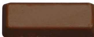
G320 Brown Buffing Compound