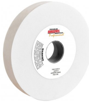
G171 White - Alox Grinder Wheel