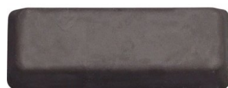
G323 Grey Buffing Compound