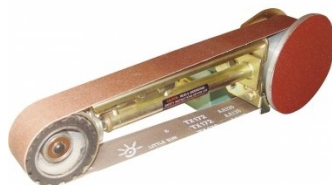
L088 Multitool Belt & Disc Linishing Attachment