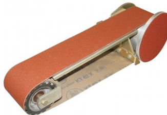
L089 Multitool Belt & Disc Linishing Attachment