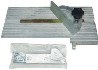
L086 Multitool Tilting Table & Mitre Guide