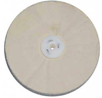
G186A Buffing Mop