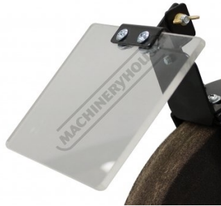
Adjustable Eye Shields