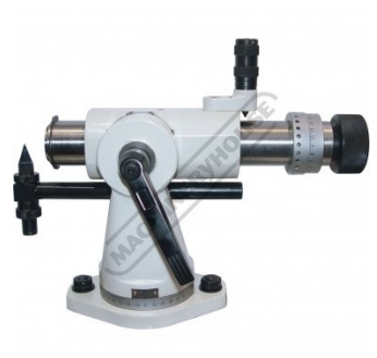
End Mill Attachment