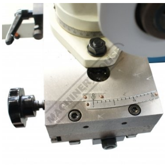
Table Angle Adjustment