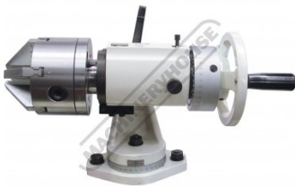
Drill Grinding Attachment