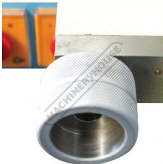
Longitudinal Feed Dial