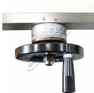
Cross Feed Handle