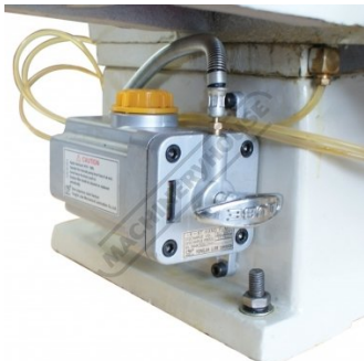
One Shot Lubrication Pump