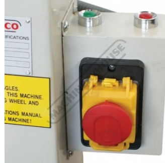
Start & Stop with Emergency Stop