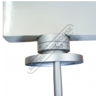
Cross Feed Dial