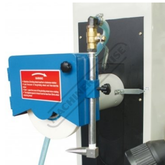
Wheel Coolant Nozzel