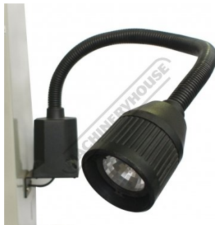
Flexible Halogen Work Light