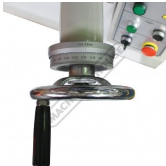
Vertical Travel Dial 0.01mm Graduations