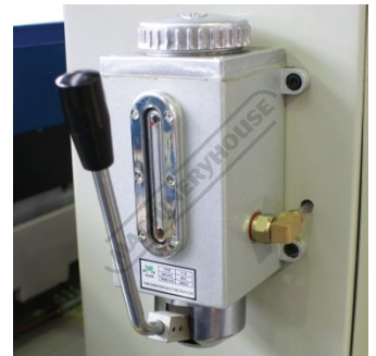
One Shot Oil Lubrication