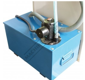
Coolant Pump & Tank