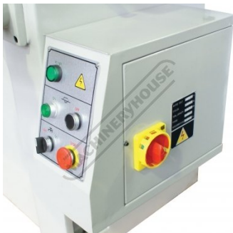
Electrical Cabinet with Stop Switch