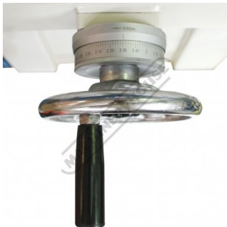
Cross Travel Handle 0.02mm Graduations