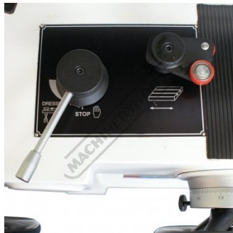
Hydraulic Table Feed Control with Rapid