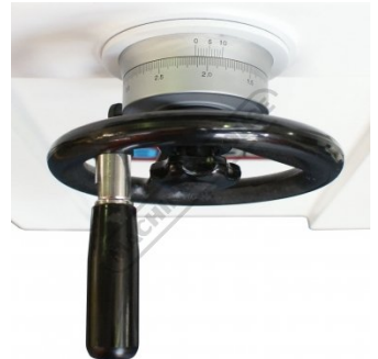
Cross Feed Dial