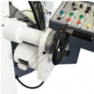
Fine Feed Height Adjustment Dial