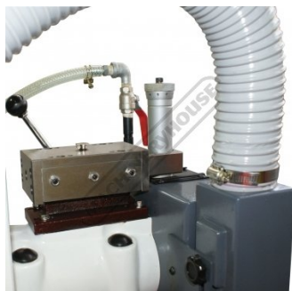
Parallel Wheel Dresser Micro Adjustment