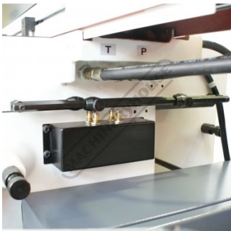
Table Direction Micro Switches