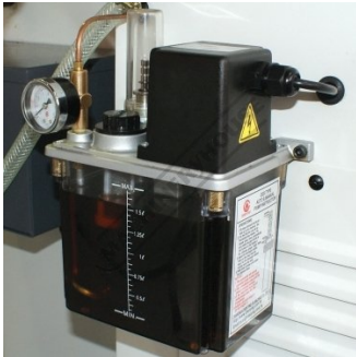
Auto Lubrication Pump