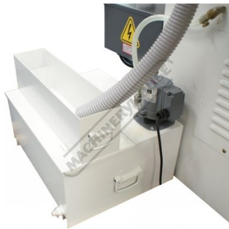
Coolant Pump & Tank