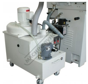
Optional Dust Suction with Coolant System