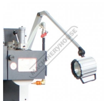
LED Work Light