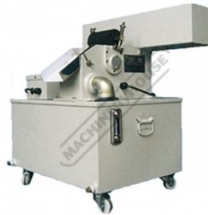
Coolant Pump Tank & Magnetic Separator