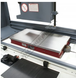
Electro Magnetic Chuck