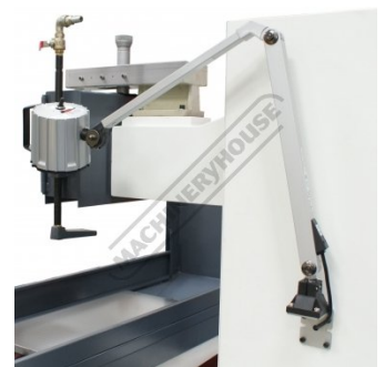
LED Work Light