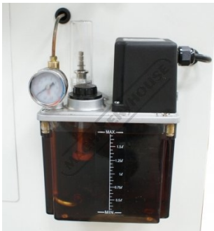
Auto Lubrication Pump