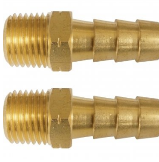
F803 Air Fittings