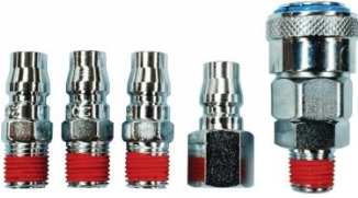
F935 High-Flow Air Fittings