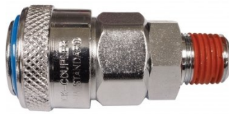
F941 High-Flow One Touch System Air Fittings