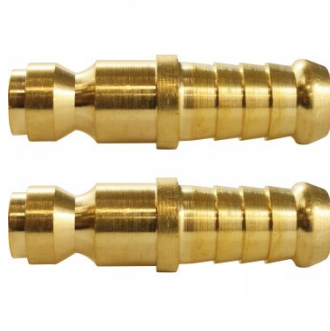
F906A Air Fittings