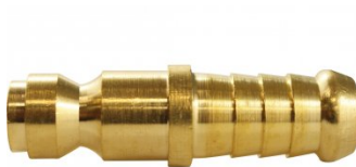
F906A Air Fittings