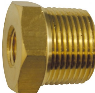
F838 Air Fittings