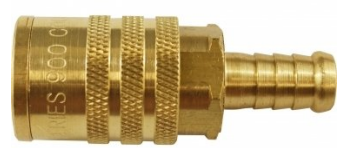
F912 Air Fittings