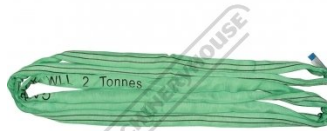
H313 Round Sling