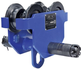
C147 Girder Trolley