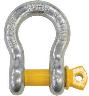
H350 11mm 1.5T Grade S - Lifting Bow Shackle