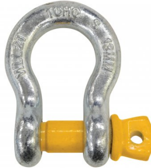
H352 13mm 2T Grade S - Lifting Bow Shackle