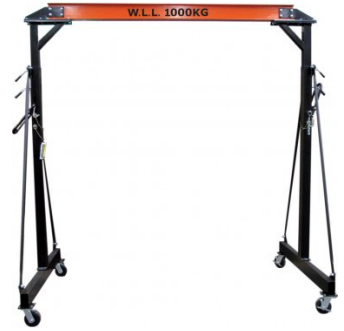
C188 Mobile Girder Rail Gantry