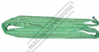
H312 Round Slings