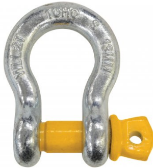
H352 13mm 2T Grade S - Lifting Bow Shackle