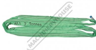
H313 Round Slings