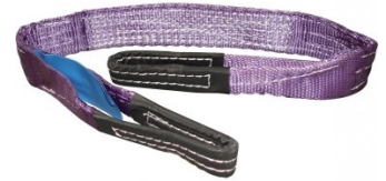
H316 Flat Slings