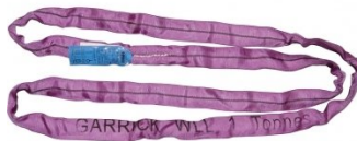
H308 Round Slings