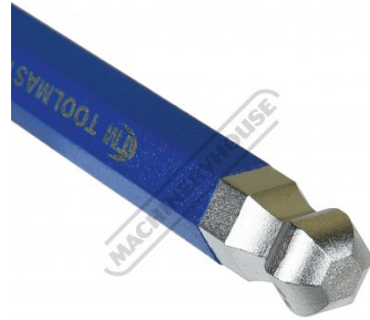
Ball End Hex Profile