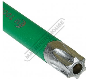
Torx Profile Botton End