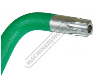
Torx Profile Top End