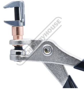
Shown using a Side Grip Clamp