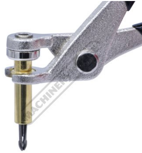
Shown using a Cleco Fastener