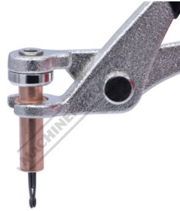
Shown in Cleco Fastener Pliers