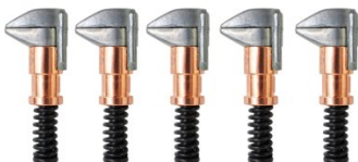
H8530 Side Grip Clamps 1/2" x 1" – Jaw Type