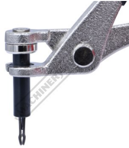
Shown in Cleco Fastener Pliers