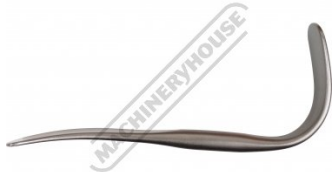
Angle and Flat Short Double Spoon