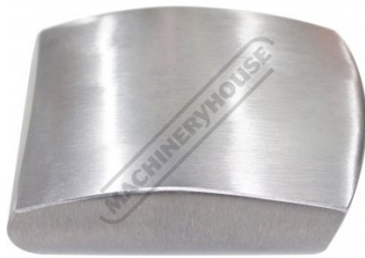
High Crown Dolly