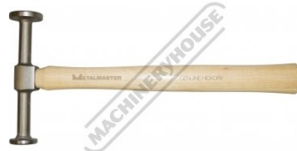
Fender and Panel Dinging Hammer