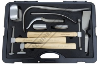
Shown in Box