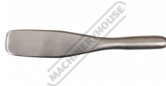
Short Single Spoon