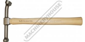
Door Skin Hammer