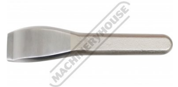
Drip Moulding Spoon